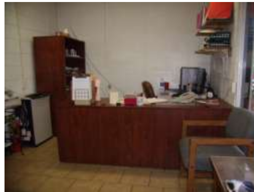
Petrohawk Energy donated office furniture for the main office and library in August