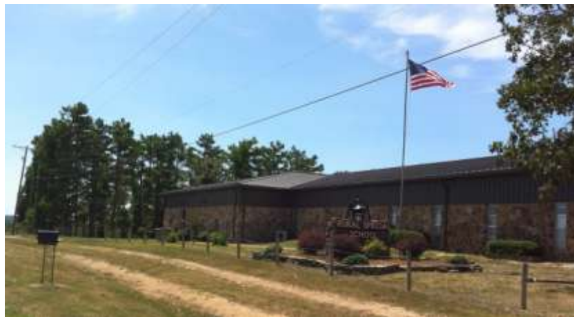
A new "pitched" roof was added to the high school in July by Noacon Inc. with funding provided by federal stimulus funds.

Rural Educational Heritage Inc.(REH) was formed last year to provide local support for Rural Special School. Although the school has been administratively controlled by Mountain View School District since 2004, there still remains strong support from the community and alumni to see the school continue to thrive and serve its students. The new organization provides a means for local support and local control of the funds. Last Fall, Friday Eldredge & Clark law firm applied for tax-exempt status from the IRS and approval was received, making donations to the organization tax deductible. The bylaws require that funds be used to benefit the school or for community projects that benefit the school. Natural gas revenue is a potential source of funds for the organization. Several land owners negotiated their lease